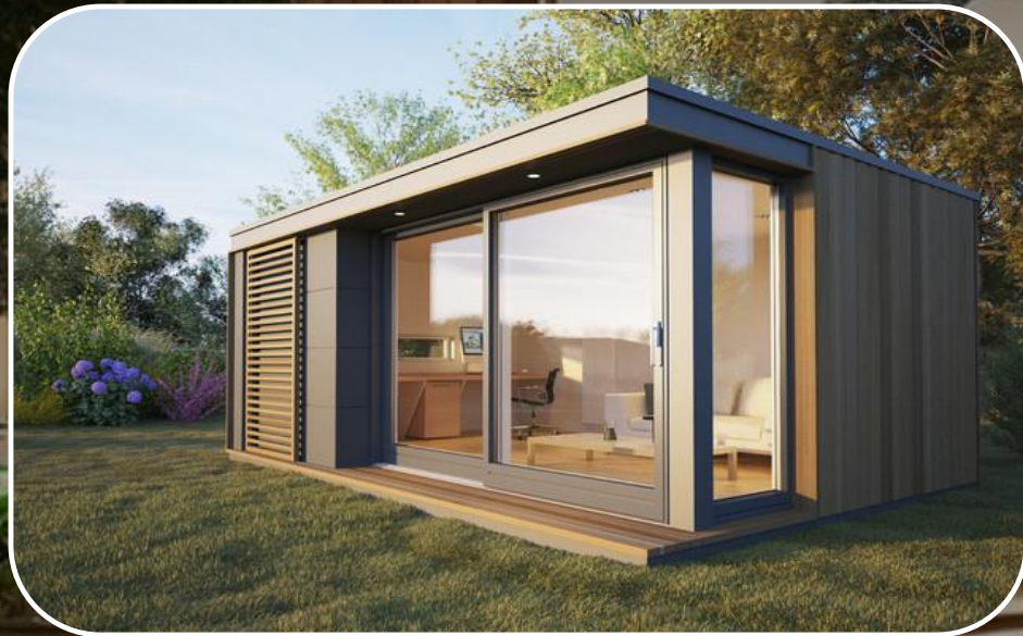
Julia Fidler, Eco-friendly Homebuilder

"Using Bio-SIP materials was a game changer for our projects. The sustainability factor and durability of the material exceeded our expectations."